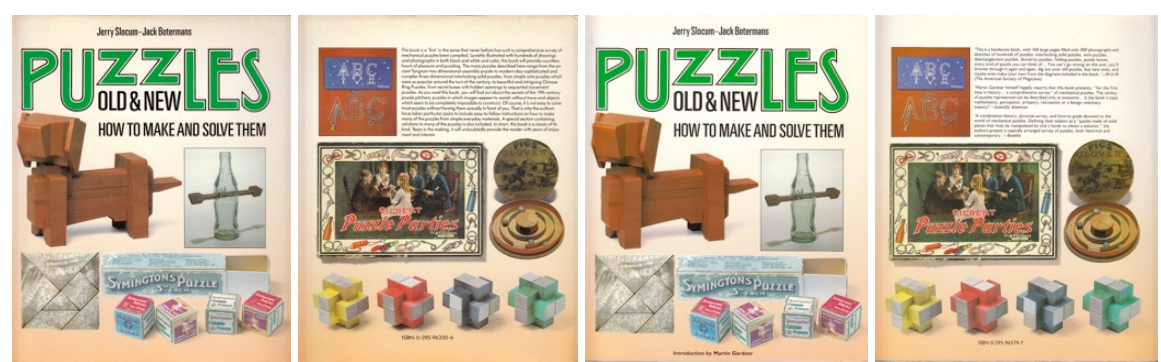
Puzzles Old & New - How to Make and Solve Them by Jerry Slocum and Jack Botermans (Plenary Publications, Distributed by U. Washington Press, 1986 hardcover 10.75 by 9.25 inches & 1987 soft cover 10.5 by 9 inches, 128 pages)