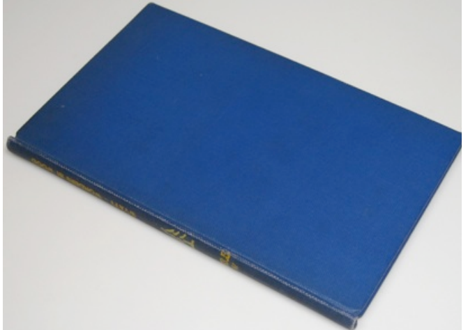
Wonders In Wood by E. M. Wyatt (Bruce Publishing Co., copyright 1946, appears to be a first printing / edition, 9.2 inches by 6 inches, hard cover, 76 pages)

These books are a nice early presentation of wood puzzles and their construction, including the Missing T ("Cut-Up T"), Tangram ("Cut-Up Square), a version of Iribako ("Bewitching Cubes"), Fifteen ("Shuffle Puzzle 1"), Dad's Puzzler ("Shuffle Puzzle 2"), a version of the Checkerboard Puzzle ("Cut-Up Checkerboard"), Towers Of Hanoi ("Peg And Disc Puzzle"), Wood Knot ("Three Piece Cross"), simple 6-Piece Burrs, and a number of other burrs. Both books have been printed many times (when Wonders in Wood was published, Puzzles in Wood was in its eighth printing); here are 2007 editions: