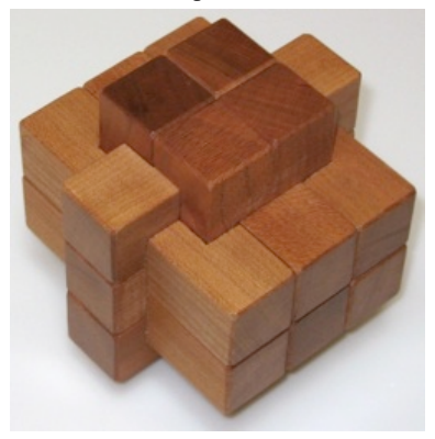
Designed by Bill Cutler and made by Jerry McFarland 2000. (wood, 3 inches, 13 pieces + 2 pins)

Looks like the Wausau '82 puzzle, but different inside; here are excerpts from the puzzle sheet (copyright by and courtesy of Bill Cutler ):