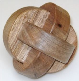
Interlocking Puzzles, circa 2000. (3 wood pieces, 2.75")