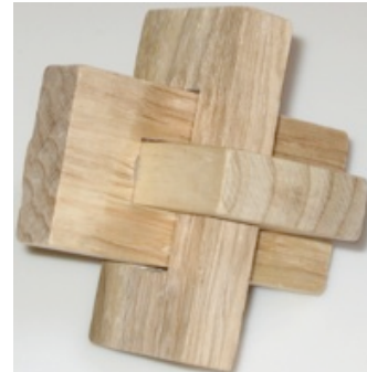
"Triple Cross", Puzzles & Brain Teasers 2006. (3 wood pieces, 3.2")

Three examples of the wood knot that was patented by M. P. Rao in 1980. Here are the directions that were sold with the Sabriday version: