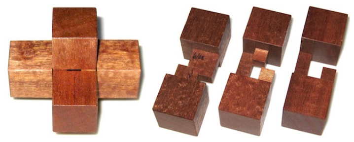
Designed by J. Krijnen, made by E. Fuller 2008, unique level 7. (Quilted Sapelle, 3 inches)