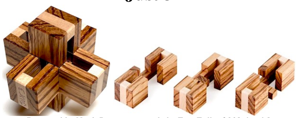
Designed by Noah Prettyman, made by Eric Fuller 2018, level 8. (Zebrawood, 3 inches square)

The pieces are precisely made, while the puzzle overall is very loose (where in only in some positions can it be stood up without a piece sliding down). Here is what the puzzle maker said: