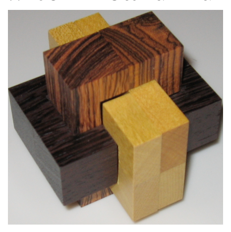
Designed by Jim Gooch, made by Eric Fuller, level 9. (Pau Amerillo / Wenge / Bocote, 3 inches)

The pieces consist of a "block", two identical "rods" in symmetric orientations, and two identical "plates" in symmetric orientations. Orientate the puzzle as shown on the left below (the right rod will drop down as shown if the puzzle is not too tight), exchange the plates by passing them through each other, then the right plate (which was the left plate) can be twisted (in two ways) and removed (or without twisting it can be slid out together with the right rod).