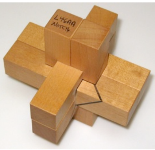
Discovered (by computer) and made by B. Cutler 1987, level 10, 9 holes, notchable. (Maple, 3.6 inches)

Non-unique with solutions below level 10, but made to be unique level 10 by drawing diagonal lines on the pieces that must form a loop around the puzzle when solved.