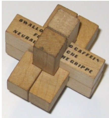
Pheno-Caffein Co., Worcester, MA, circa 1910. (wood, 2.1 inches)

The Pheno-Caffein Co. also made the Sectional Checkerboard Puzzle , and like that puzzle, one could obtain a solution: