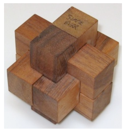
Old design, level 1, no holes, notchable. (six wood pieces, 3 inches)

The basic idea of level 1 with a key piece is described on pages 106 and 139-140 of the 1983 Hoffmann book . This one is even simpler. Pieces 1, 2, and 3 are identical, pieces 4 and 5 are identical, and piece 6 is a simple solid "key" piece that comes out first.