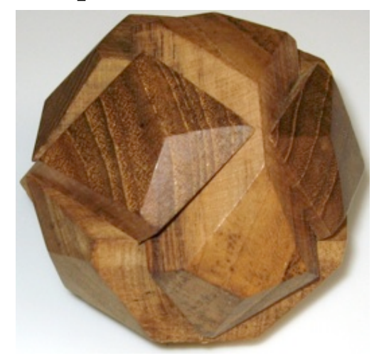
Made in Indonesia 2004. (wood, 3.2 inches)