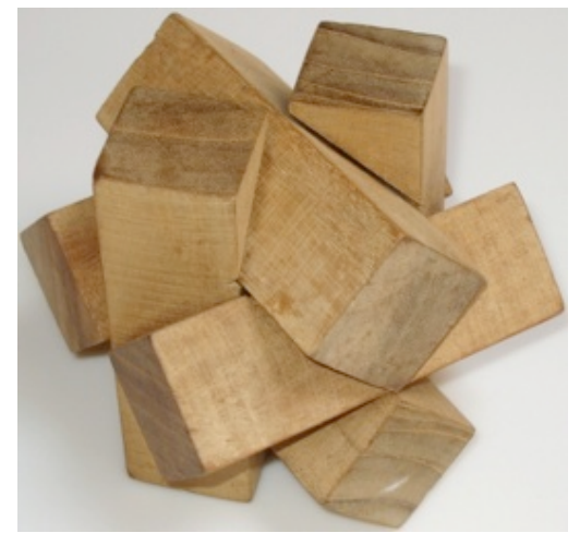
Made in Indonesia 2004. (wood, 3 inches)