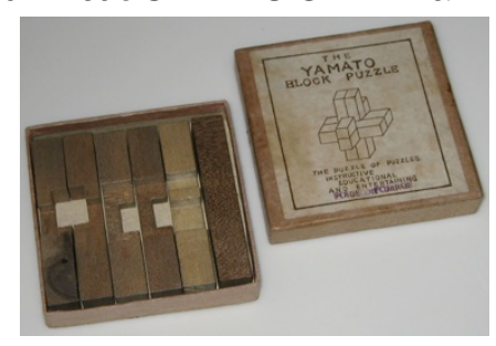
Made in Japan circa 1930?, level 1, no holes, notchable, 2x2x12 pieces. (cardboard box and 6 wood pieces, nnn inches)