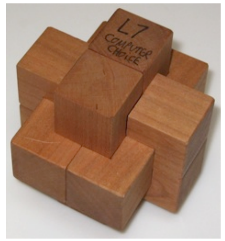
Discovered (by computer) and made by B. Cutler 1988, unique level 7, 3 holes. (Cherry, 3 inches)