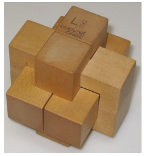
Discovered (by computer) and made by B. Cutler 1988, unique level 8, 4 holes. (Maple, 3 inches)