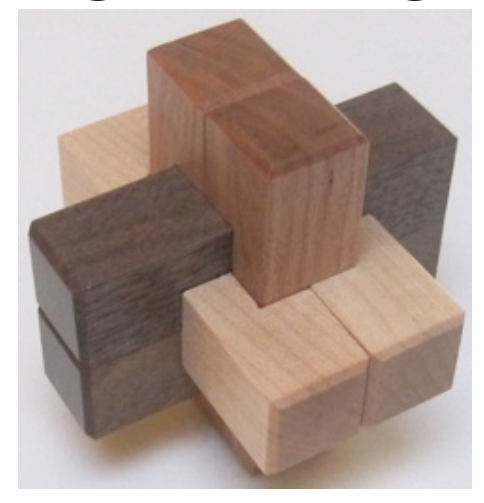
Discovered (by computer) B. Cutler, made J. McFarland 2009, unique level 8, 7 holes. (Maple / Walnut / Cherry, 2.8 inches)