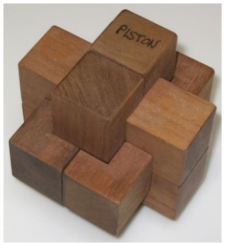
Designed by P. Marineau, made by J. McFarland 1986, unique level 9, 7 holes. (Walnut, 3 inches)