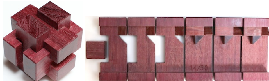
Designed by Gregory Benedetti, made by Maurice Vicourouz 2012. (Purple Heart, 3.25 inches)

Pieces are a small cube trapped in the center, three identical "simple pieces", and three identical "complex" pieces. Assembly is relatively easy, where the three complex pieces and the cube are put compactly together as shown on the left in the figure below (rubber bands keep them together for the photo) and then the three simple pieces slide simultaneously over the exposed corner: