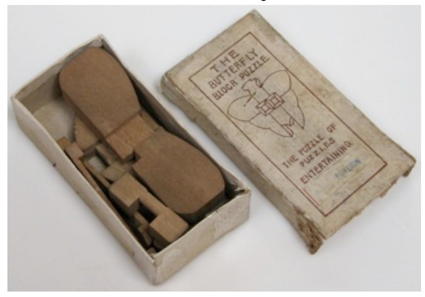
Made in Japan circa 1930?, level 1. (cardboard box and 6 wood pieces, 3 inches; box cover similar to other vintage Japanese exports like the Yamato Puzzle) Here is the solution sheet that came with it: