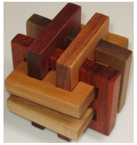
Made by D. Alsmeyer 2007, Sabriday Puzzles. (6 different woods, 3.5 inches)

The booklet that comes with the retail plastic puzzle shows 65 steps to completely take the puzzle apart. McFarren's Page shows a solution that removes the first piece in 28 steps, and completely takes the puzzle apart in 35 steps.