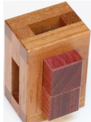
Designed by Osanori Yamamoto, made by E. Fuller 2013, Level 14. (Jatoba and Purpleheart, 2.25" x 1.5" x 1.8")

To disassemble, exchange the two trapped pieces, maneuver a bit, and then the two can be manipulated out of the cage; here are some selected positions: