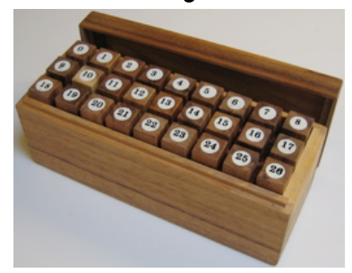
Purchased from Creative Craft House 2007. (wood box 3.4" x 9.25" x 4.1" with 27 wood pieces, each 3.1" long by 3/4" square)

This set has 27 2x2x6 unit standard 6-piece burr pieces numbered from 0 to 26, where piece 0 is the solid piece. A total of 69 different level 1 standard 6-piece burrs can be selected, where all use piece 0 as a key piece, and the other 5 pieces are specified with a tic-tac-toe notation: