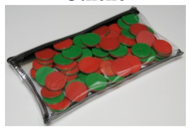
Copyright xxx, this set made by J. A. Storer, 2005. (x" diameter poker chips glued together; used with a chess board)

Board: An 8 by 8 board (e.g., a chess board where square colors are ignored).