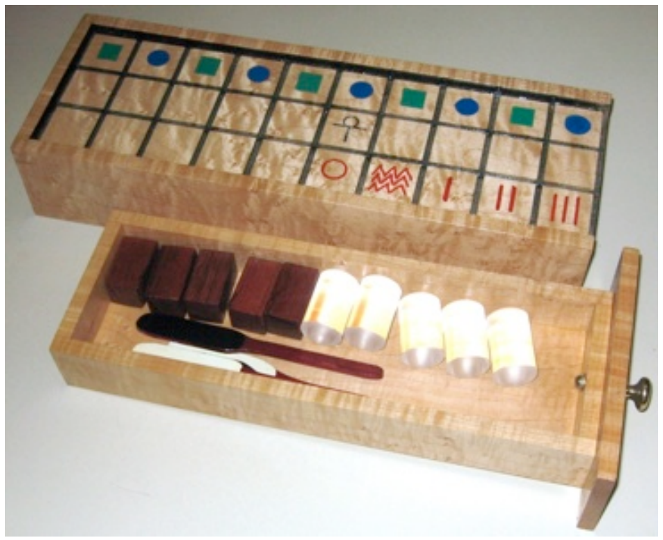
Made by J. A Storer, 2005. (birdseye maple box and wood drawer, 5 rectangular purpleheart pieces, 5 cylindrical plexiglass pieces, painted mahogany black and white paddles with red handles, 3 x 6 x 15 inches)