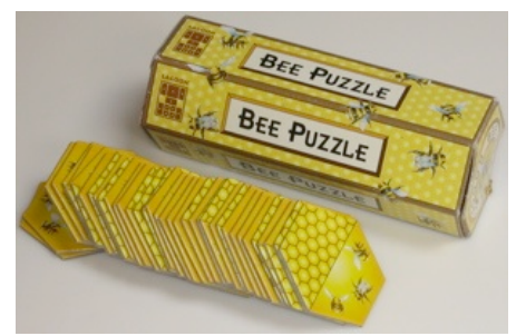
Lagoon Games, 2000.

(2 by 6 inch cardboard box with 37 hexagonal cardboard pieces)