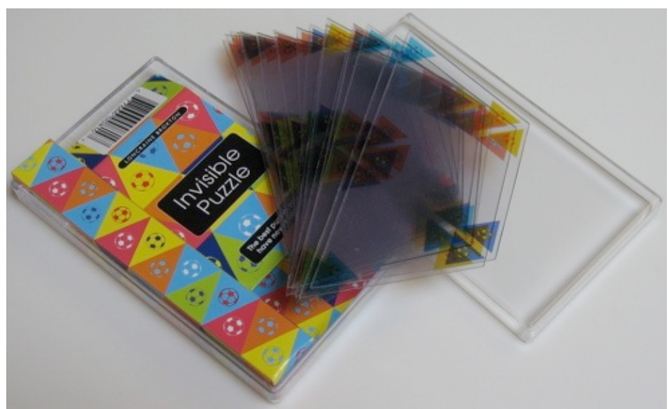
Lagoon Games 2007. (plastic box and 18 half hexagon plastic plates, 3 by 5 by 3/4 inches)

Form a big hexagon from the 18 half hexagon pieces so that edges match. Puzzles of some type using half hexagons have been around for a long time (e.g., the 1924 patent of A. Chrehore). Here is the solution provided by the manufacturer (http://www.give-me-a-clue.com):