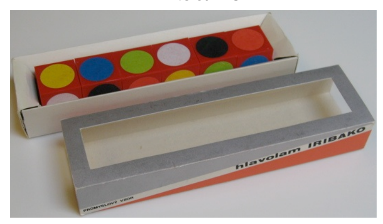
Made in the Czech Republic 1983. (box and six 1.2 inch plastic cubes)

Each of the six cubes has a different one of the colors red , blue , green , yellow , white , and black , on each side. This puzzle is similar to Drives You Crazy , but with a different color pattern. Like the four block Instant Insanity puzzle, the object is to arrange the cubes in a line so that each side has no duplicate colors. Here is a solution and its corresponding graph (constructed the same way as for Instant Insanity):