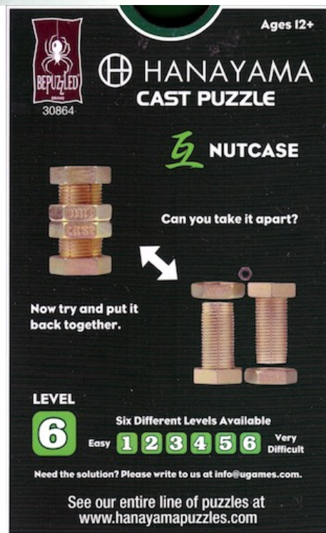
Hanayama Cast Puzzle, purchased from Amazon.com, 2018. (metal, 5 pieces, 1+7/8 inches long, nut heads are 1 inch between faces)

The little nut is not important to the puzzle; it is just something to store inside. When apart, both big nuts will thread all the way onto the two pieces. But to take the puzzle apart, the two pieces must slide apart when the missing threads on the big nuts line up exactly. There are some false seams so that the body appears to have 6 equal sections, when there are really only 4 sections. The puzzle is made quite difficult because it cannot slide apart all at once. First things have to be lined up exactly to slide a bit and then exactly another way to slide further. After two such steps the nuts come apart enough to get the little nut out, but two more steps are needed to get the pieces all the way apart. One approach is to start with the big nuts close to each end for the first two steps, and then closer to the middle for the next two steps; for each step, hold one end leaving the assembly hanging down and gently turn a nut to feel a slight release.