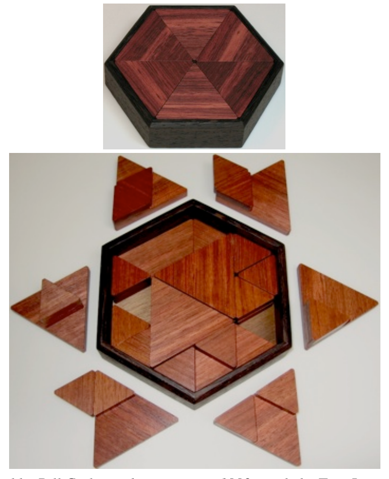
Designed by Bill Cutler with a computer 1992, made by Tom Lensch 2004. (Wenge box with Bubinga pieces, 5 inches)

Here are the layers of the unique solution from the sheet that was sold with with the puzzle (copyright by and courtesy of Bill Cutler ):