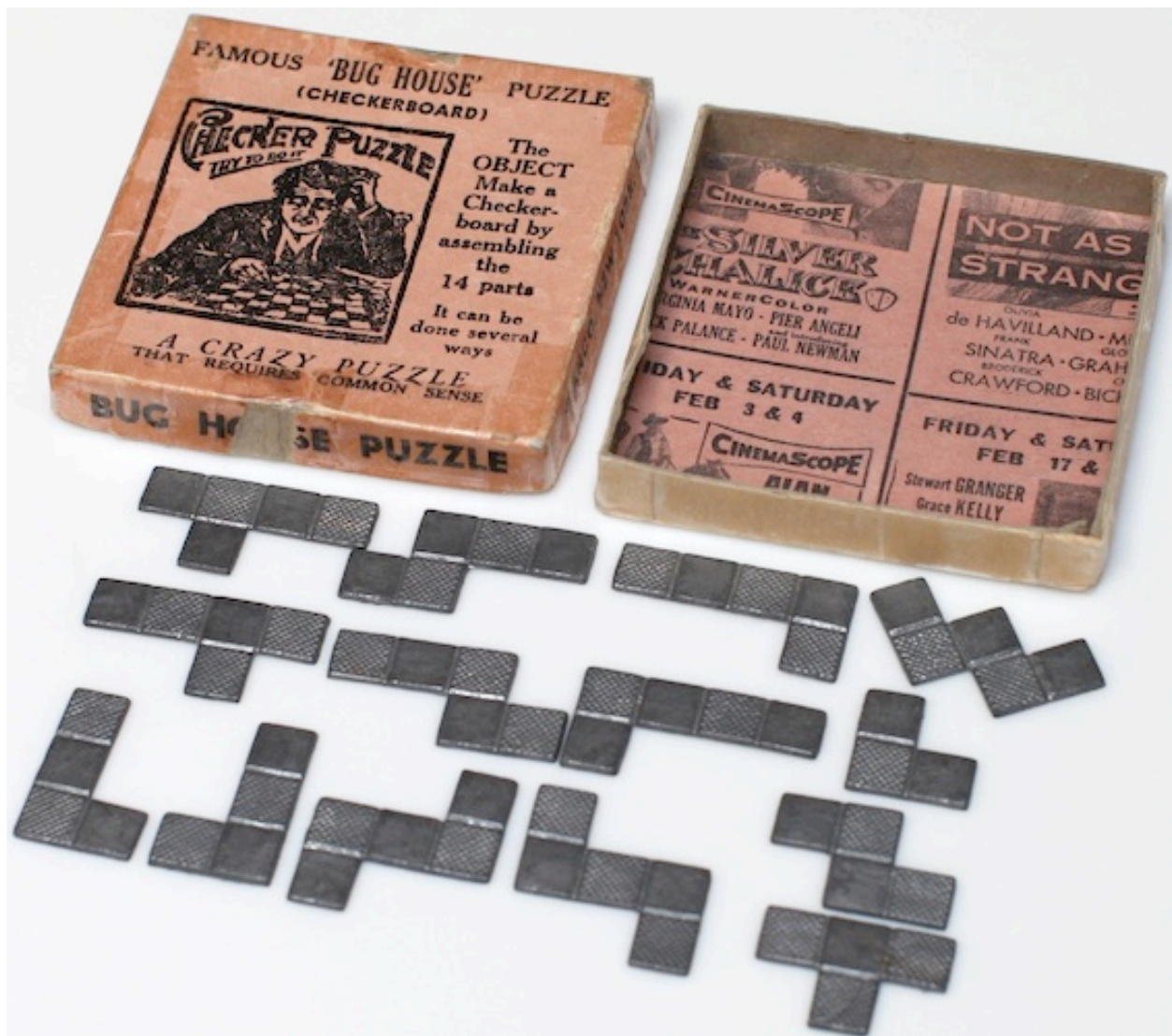
Franco, NY, circa 1948. (cardboard box and 14 distinct metal pieces, 3.25" x 3.25" x 1/2")