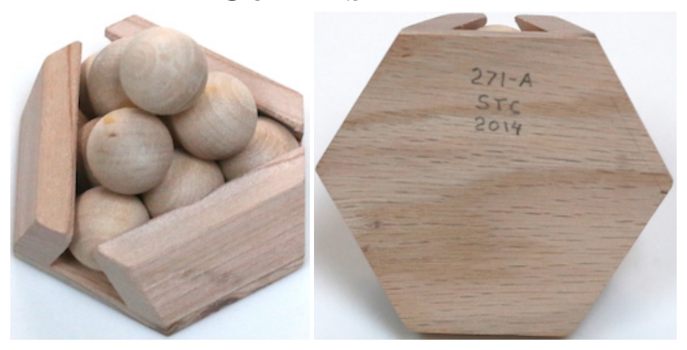
Designed and made by Stewart Coffin, 2014. (maple pieces and sides on plywood base, signed on the bottom; 2.25" high, top edges of walls are 2", balls are 3/4" diameter; one of 4 puzzles purchased during a visit with the designer in 2014)

Unpacking requires moving the top two pieces out of the way and removing the bottom one first: