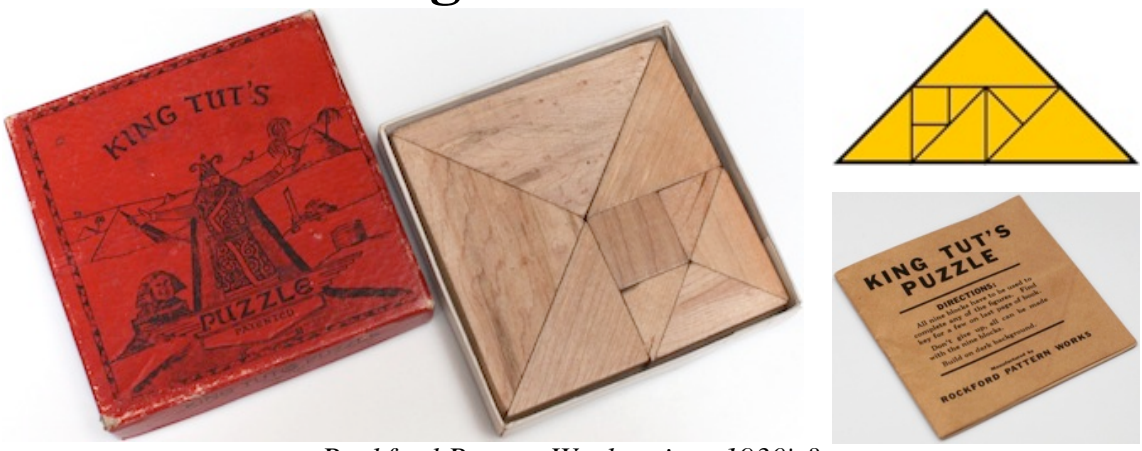
Rockford Pattern Works, circa 1930's? (4.25" square by 5/8" thick box, 9 wood pieces, and 4" square booklet; some versions have the Rinehimer Millwork label on the box top)

Like the Anchor Puzzle Tangram , a booklet shows shapes to make. Here are the booklet pages (page 1 and the last page are shown together):