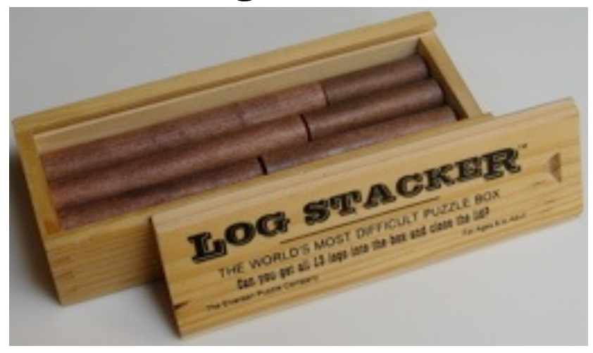
Elverson Puzzle, 2002. (wood box and 13 wood rods, 2.75 by 7.5 by 1.75 inches)

Pack 13 wood rods into the box. Here are th directions on the bottom of the box: