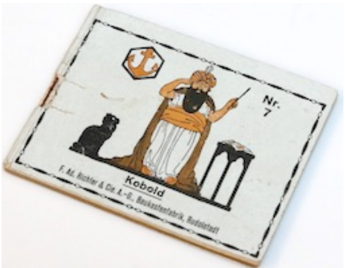
(cardboard box 3" x 4" x 9/16", 7 stone pieces, and booklet) The inside of the cover shows how to pack the pieces into the box; booklet shows the same shapes as the puzzle on the previous page, but includes no text.