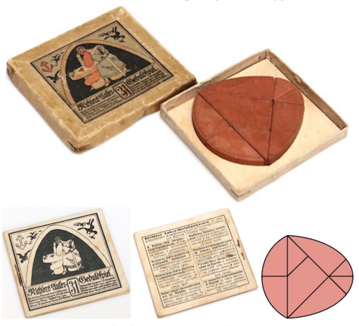
F. Ad. Richter & Co., Germany, early 1900's. (cardboard box 3+7/16" x 3+5/8" x 1/2", 8 stone pieces, and booklet; the Anchor Puzzle Book dates this puzzle as first made in 1917; similar in construction to the Anchor Puzzle Tangram; the inside of the cover shows how to pack the pieces into the box; the booklet has 19 pages of text in multiple languages, and 32 pages with 96 shapes to make, where the first is the box packing shown above; a scan of the booklet is shown on the following pages)