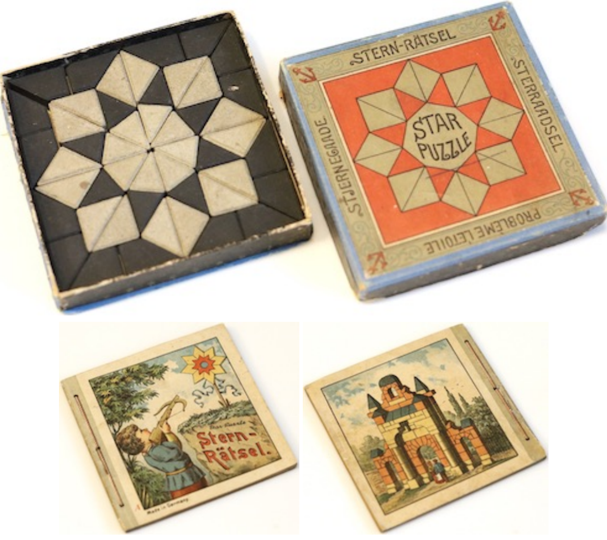
Different box and booklet cover art from the puzzle of the preceding page, but otherwise the same)