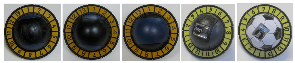
Patented by A. Unsicker 1999. (plastic, 3.5 inches, the back side of each number is white)

Numbers are yellow on one side and white on the other, and can rotate any number of positions in either direction. In addition, there is a north pole that spans three numbers (13, 1, 2 in the photos above) and a south pole that spans four numbers (6, 7, 8, 9 in the photos above); a flip turns these 7 numbers along the pole axis: