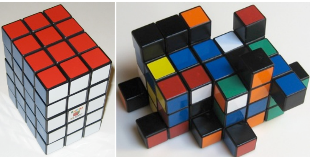
Made by Fabio Causarano , 2007. (plastic, 2.2 by 2.9 by 3.7 inches)

Like the Evil Cuboid 2x3x4, constructed by combining Rubik's cube mechanisms. Here is an example of a sequence of four moves::