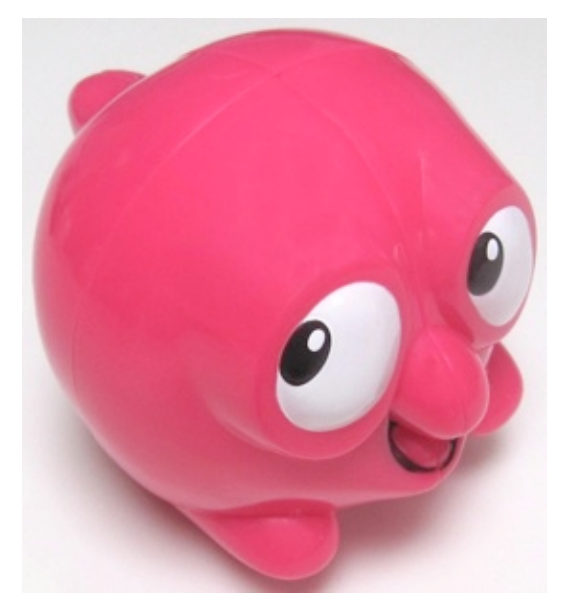
Availabe at McDonalds in the U.K. 2002. (plastic, 3.5 inches)