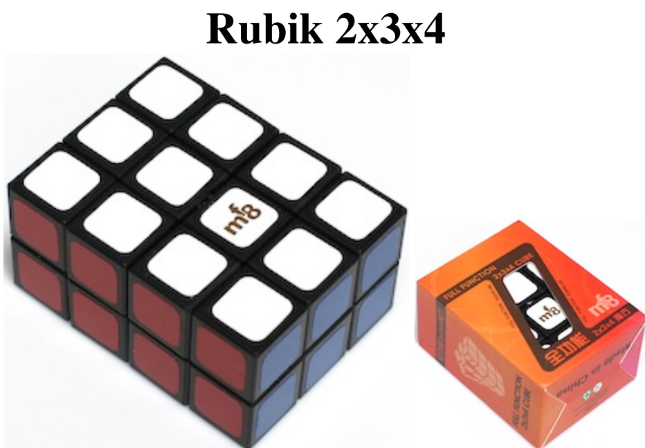
Made in China , 2012. (plastic, 2.8" x 2.1" x 1.4" inches)

The shape can change quickly. Here are three successive moves; the first turns the back face 90 degrees clockwise, the second turns left and right two halves 180 degrees with respect to each other, and the third turns the front face 90 degrees counter clockwise: