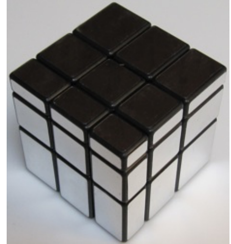
a.k.a. Mirror Block, Yong Jun Cube Purchased from Yong Jun Toys / Mega House, 2009. (plastic with silver stickers, 2.25 inches)

A version of the standard Rubik's 3x3x3 cube where the cube sizes progress from small to large in all three dimensions. Each piece is distinguished by its shape rather than it color. Here are photos of three successive moves: