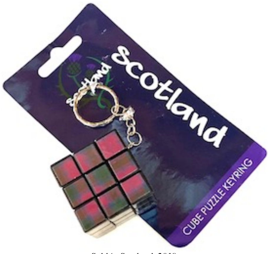
Sold in Scotland, 2019. (plastic, 1+3/8 inches square)

Like the Rubik 3x3x3 Fourth Dimension, orientation of center squares matters. In addition, all sides are different but similar (harder to see where squares should go when the puzzle is mixed) and the centers must be oriented to match the direction of the fabric: