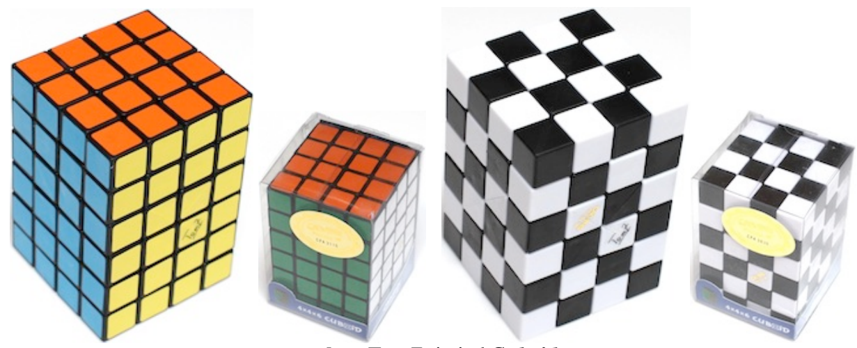
a.k.a. TomZ 4x4x6 Cuboid

Purchased from Mefferts; made by the Now Store, Hong Kong, 2012. (plastic, 2.5" x 2.5" x 3.5"; orange opposite red, blue opposite green, yellow opposite white)