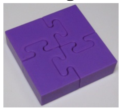
Patented K. Walker & designed with H. Nelson, made by Binary Arts, circa 2000. (four plastic pieces, 4 x 4 x 3/4 inches assembled)

The four pieces do not simply come apart as it appears they might; careful positioning and twisting is required; here is the solution that was sold with the puzzle: