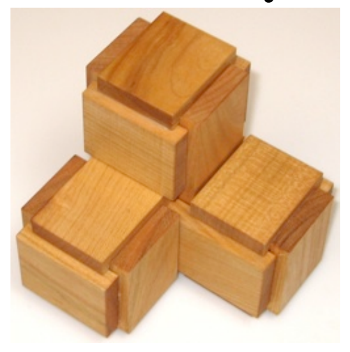
Vin & Co., purchased from Bits & Pieces 2007. (wood, 6 pieces, 3.5 inches)

Here are the directions and solution that were sold with the puzzle: