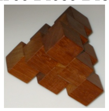
Designed, made, and sold by Stewart Coffin in 1970's and early 1980's. (mahogany, 3 pieces, 4 inches; one of 6 puzzles purchased during a visit to Coffin's house in the early 1980's)

Described in Stewart Coffin's book The Puzzling World of Polyhedral Dissections ; here is some of what he says in the directions that came with the puzzle: