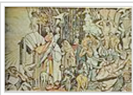
Mural General Exhibit 3rd pavilion