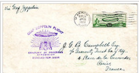
Cover carried on the Graf Zeppelin from 1933 Century of Progress Exposition franked with C-18 US Air Mail stamp issued for the airship's visit.

World's Columbian Exposition. The buildings generally had a Moderne design to them in contrast to the neoclassical themes used at the 1893 fair. One of the more famous aspects of the fair were the performances of fan dancer Sally Rand. Other popular exhibits were the various auto manufacturers, the Midway (filled with nightclubs such as the Old Morocco, where future stars Judy Garland, The Cook Family Singers, and The Andrews Sisters performed), and a recreation of important scenes from Chicago's history. The fair also contained exhibits that would seem shocking to modern audiences, including offensive portrayals of African-Americans, a "Midget City" complete with "sixty Lilliputians", [3] and an exhibition of incubators containing real babies, [4]