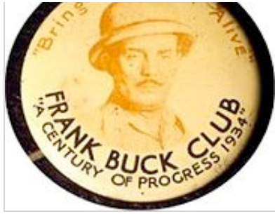
Frank Buck souvenir badge

record-breaking dawn-to-dusk run from Denver, Colorado, to Chicago in 13 hours and 5 minutes. To cap its record-breaking speed run, the Zephyr arrived dramatically on-stage at the fair's "Wings of a Century" transportation pageant. The two trains launched an era of industrial streamlining.