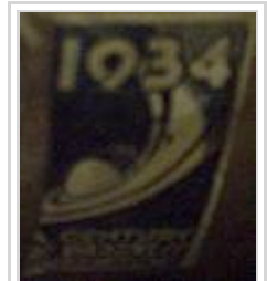
The 1934 World's Fair paper label