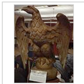
This is one of the eagles that stood on pedestals along Lakeshore Drive and Michigan Avenue in Downtown Chicago during the World's Fair.