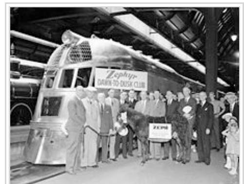
The Pioneer Zephyr arrives in Chicago after its record-setting run from Denver on May 26, 1934.

The first Major League Baseball All-Star Game was held at Comiskey Park (home of the Chicago White Sox) in conjunction with the fair.