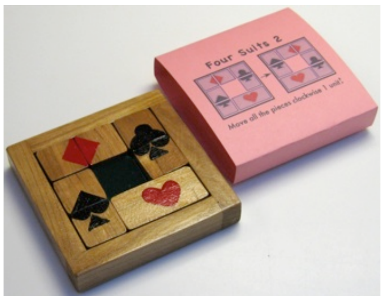
Designed by Serhiy Grabarchuk, made by J. A. Storer 2007. (4" x 4" x 3/4" wood tray, 7 wood pieces, and black plexiglass keeper)