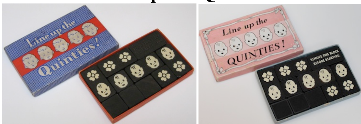
The Embossing Company, Albany, NY, 1934. (cardboard box 3.5 by 5.4 by 1/2 inches, 2 styles shown above, and ten wood pieces; described on page 70 of the Hordern book, where it is dated and credited as named to celebrate the birth of the Dionne quintuplets; same manufacturer and box style as the Fifteen, Time, and Missionary Puzzles)

Line up the quints in the center row from the specified starting position; the directions are shown on the next page; here are diagrams of positions 0, 4, 8, 12, 16, 20, 25, 30 of the Hordern book solution of 30 rectilinear moves (equal to 33 straight-line moves):