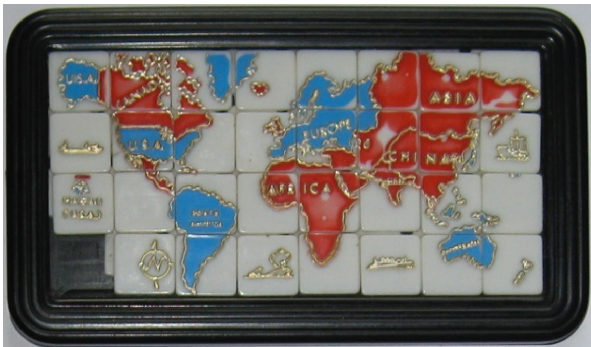
"Roalex's Zig-Zaw Puzzle Map of The World", circa 1960s.

Puzzles of individual states have also been made (e.g. Oklahoma).