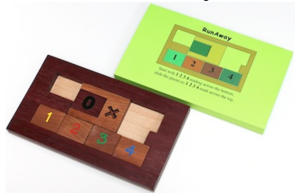
Designed by Minoru Abe, this one made by J. A. Storer 2011. (cardboard sleeve, Purple Heart, Cherry, Maple tray and pieces, 4.6" x 8" x 5/8")

The start position has pieces labeled 1, 2, 3, 4 (in that order) along the bottom, and on top a Ushaped piece X that has piece O captured inside. The goal is to slide the pieces so that 1, 2, 3, 4 (in that order) is on top. One way to think of solving is to repeatedly place the puzzle in a position where there is an empty vertical column that allows pieces to be exchanged. Here are the start position, the end position, and each of the empty column positions in a 45 move solution (and with 1 or 2 additional moves the X and O pieces can be arranged as desired on the bottom).