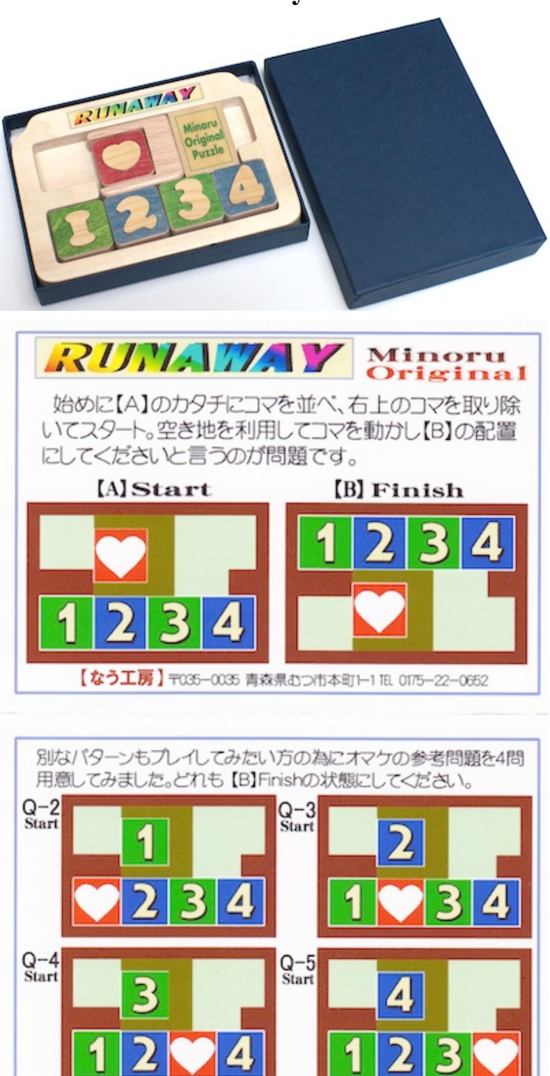
Purchased 2012. (wood tray and pieces in a cardboard box, 3.7" x 5" x 7/8")