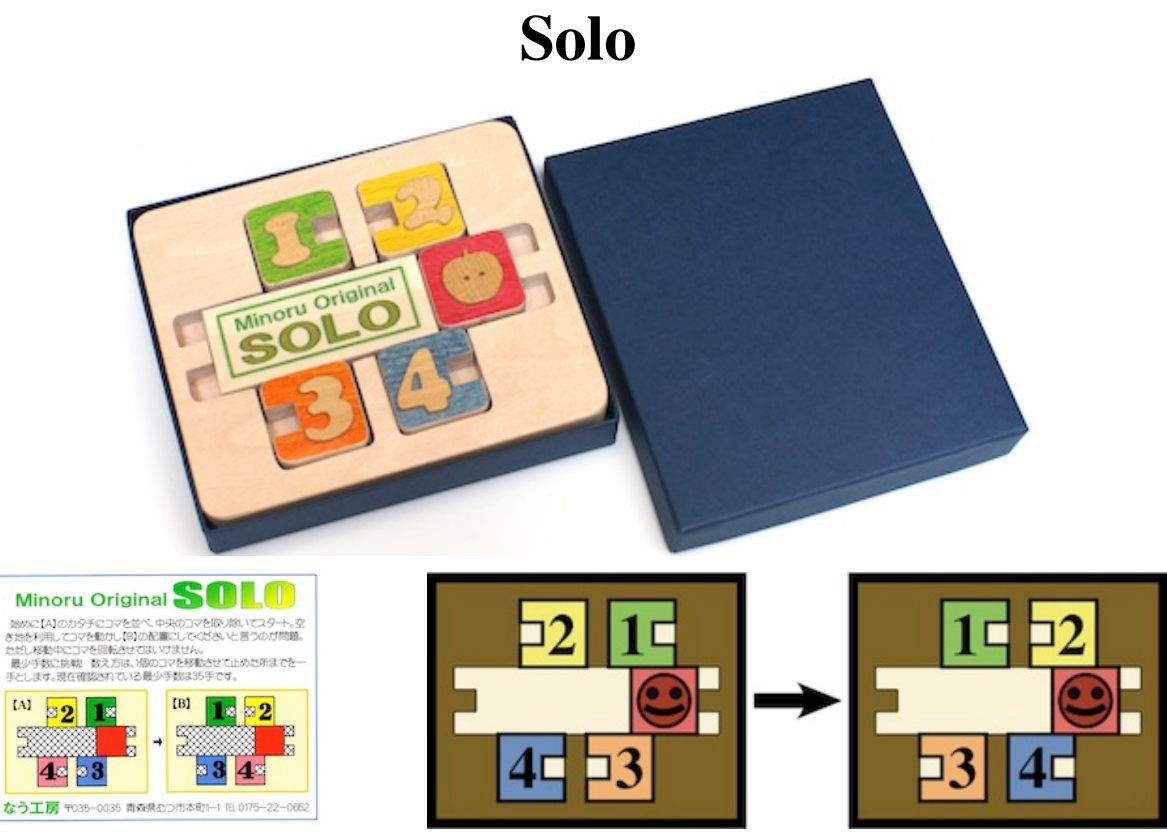
Designed by Minoru Abe, purchased 2012. (cardboard box, wood tray, 5 wood pieces, and wood keeper, 4.4" x 5" x 7/8")

Pieces are 3 units square; all notches and protrusions are 1 unit square. With the keeper removed, exchange pieces 1 and 2 and exchange pieces 3 and 4. Here is the start, every 7th move, and the final position of a 35 Rectilinear moves (75 Straight-Line moves, 256 unit moves) solution: